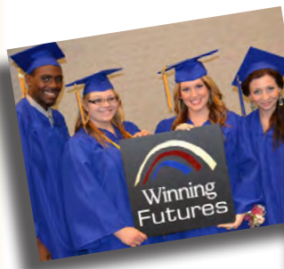
2012 scholarship recipients.