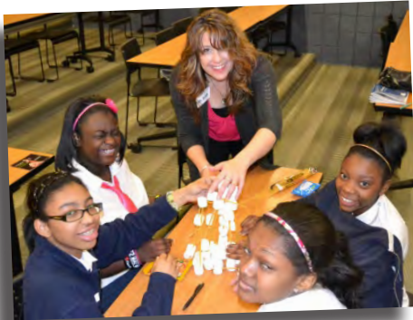
UPSM HS students take part in a fun attitude related activity: Building a tower out of spaghetti and marshmallows!

The blended funding grant from the United Way of Southeastern Michigan has enabled Winning Futures to provide life skills and goal-setting programs in two Wayne County Schools: Harper Woods High School in Harper Woods and University Prep Science and Math High School (UPSM HS) in Detroit. In total, 205 students will be impacted because of the grant. Half of the program funds are provided by the grant while the other half are raised through donations.