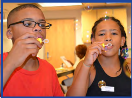
Golightly Education Center students “pop their test stress away” by blowing bubbles at Winning Futures’ summer program.

Winning Futures hosted summer school and Train-the-Teacher programs at several Detroit Public Schools this spring and summer. These programs were made possible through the generous sponsorship of Sodexo and the Detroit Public Schools Foundation .