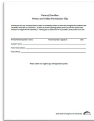
Print photo release 1 time